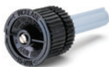
High Efficiency Variable Arc Nozzles (2.4 m, 3.0 m, 3.7 m, or 4.6 m) are available pre-installed